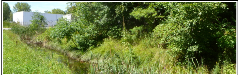
Existing site with stream/wetland along property line