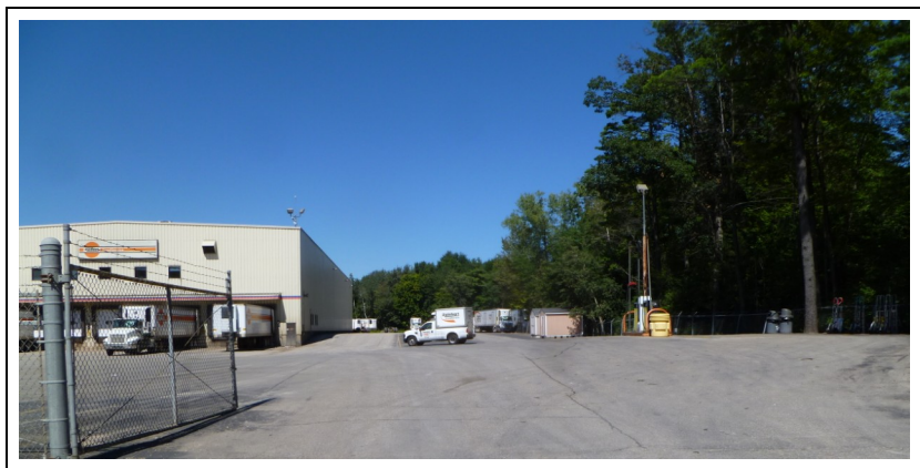
Expansion of parking/truck lot for proposed site