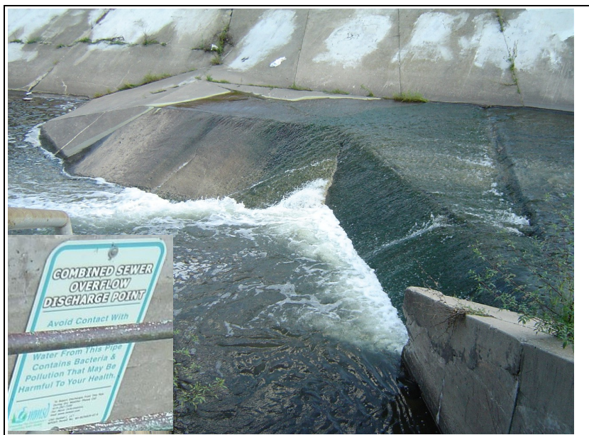
Location of Combined Sewer Crossing and Overflow Point