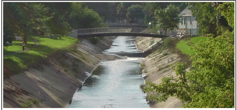
Existing Concrete Lined Channel